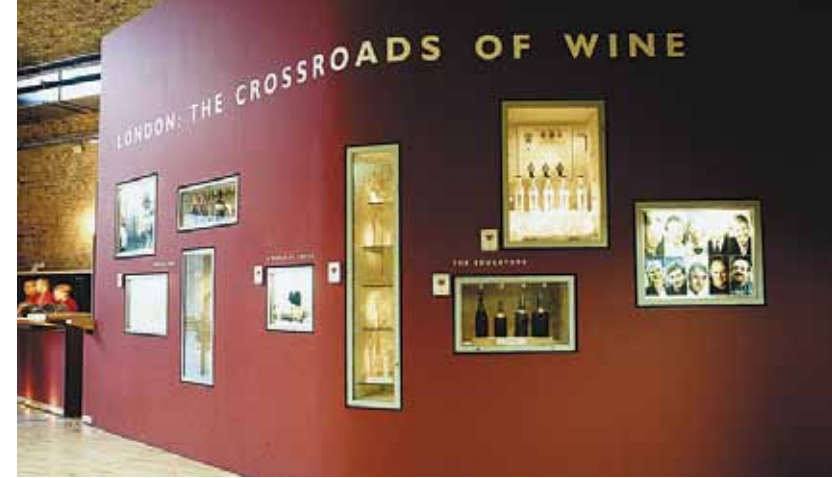
Fresco case (above and below) - Photography by Netherfield