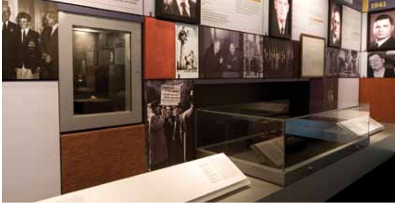
Fresco (Prism case on bench) - Old Parliament House, Canberra

These secure hinged case fronts are widely specified for fitting to a steel, plywood or EO MDF carcass. They provide a high security case with 100% hinged door access. The dual action hinge is fully concealed and located at the top and bottom of each frame. The door opens within its own width allowing these cases to be inset or flush mounted into a wall or recess. A case set through a wall can have a Fresco front on either side.