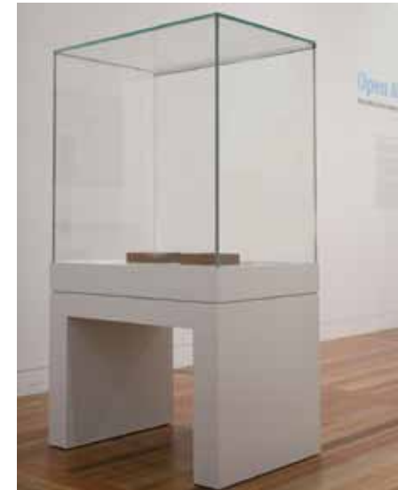
Vista 1 case - National Portrait Gallery, Canberra