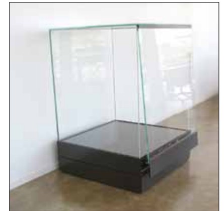
Vista 1 case (above and below)