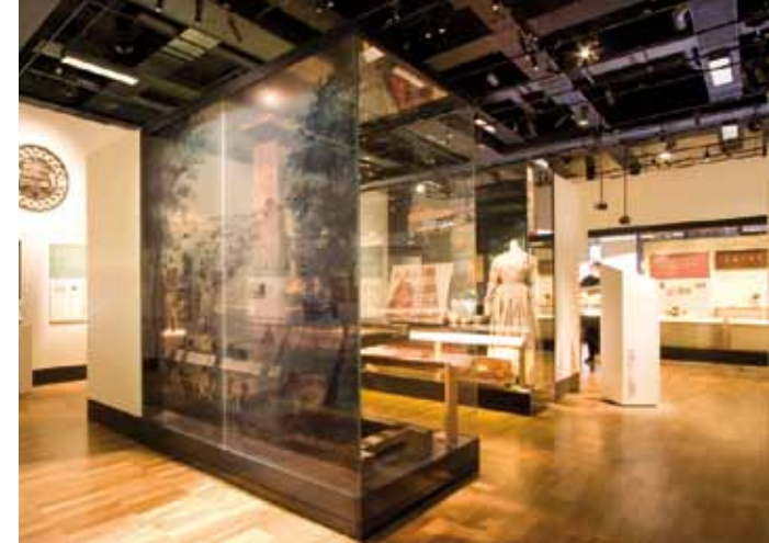
Vista 4 and Vista 1 case - Melbourne Gallery, Melbourne Museum