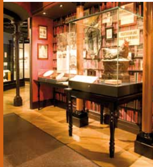
Vista 1 - Melbourne Gallery, Melbourne Museum (below)