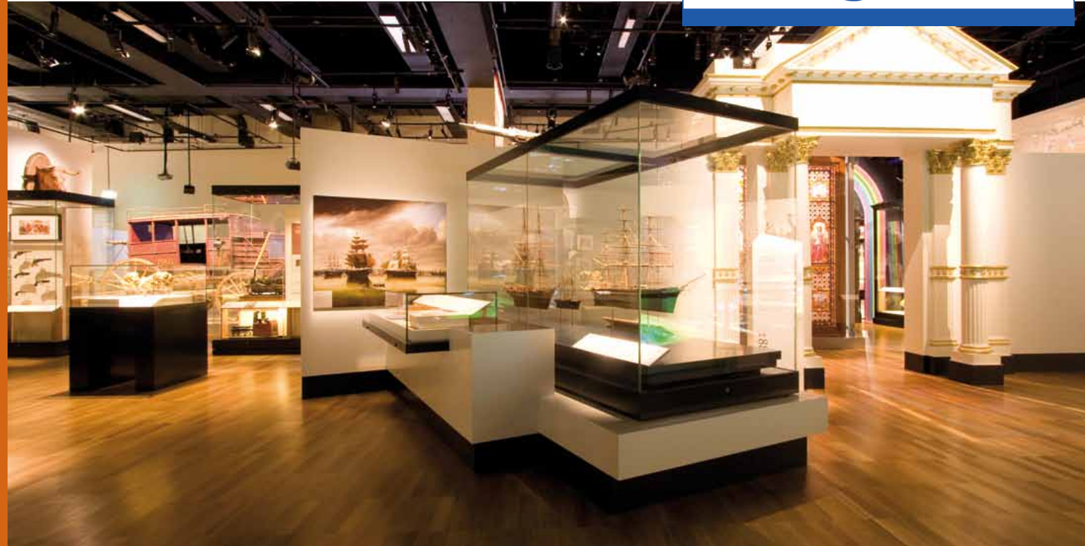
Vista 4 and Prism case with joinery by Designcraft - Melbourne Gallery, Melbourne Museum (above)