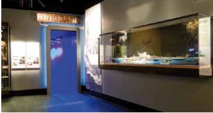
Vista 1 - Conflicts 1945 to Today, Australian War Memorial

The minimalist Vista style case, features optimum visibility with security protection. The clear glass top enables objects to be lit from external sources or by internal fibre optic LED lights. Vista cases can be single or multi-bay, freestanding or on a plinth or platform, and even wall mounted.